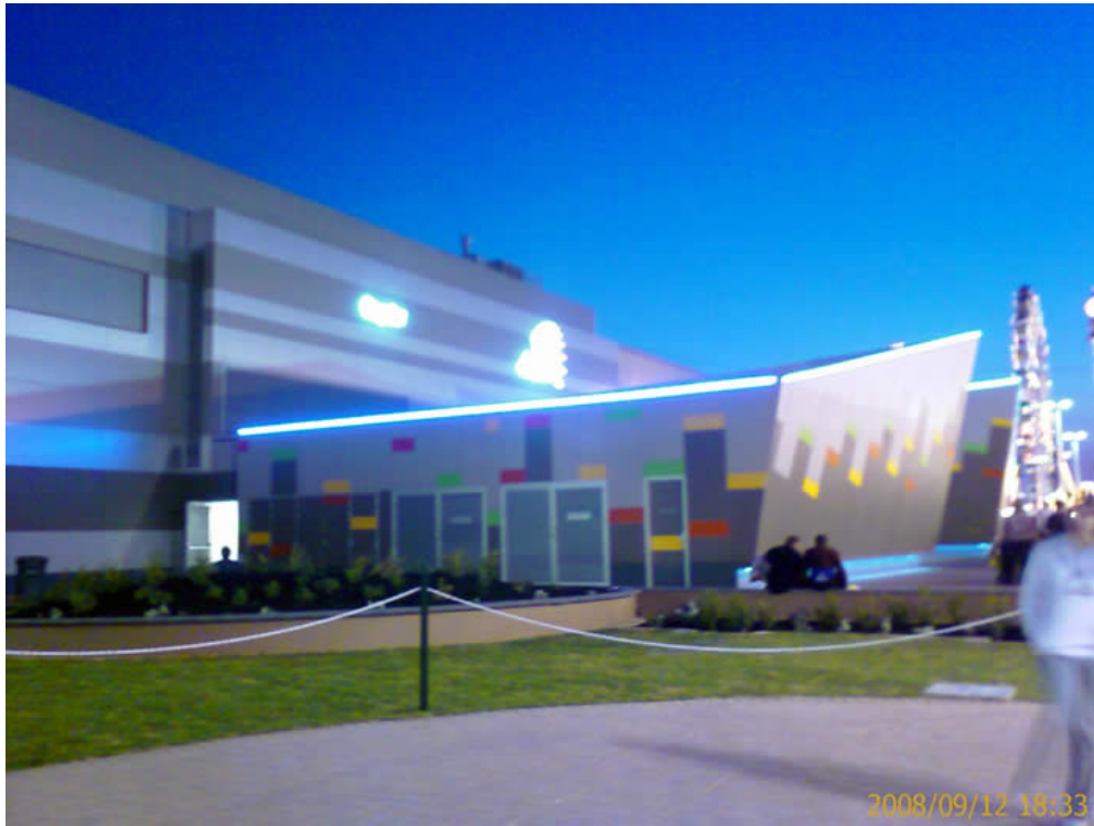
LED Post Top Lighting